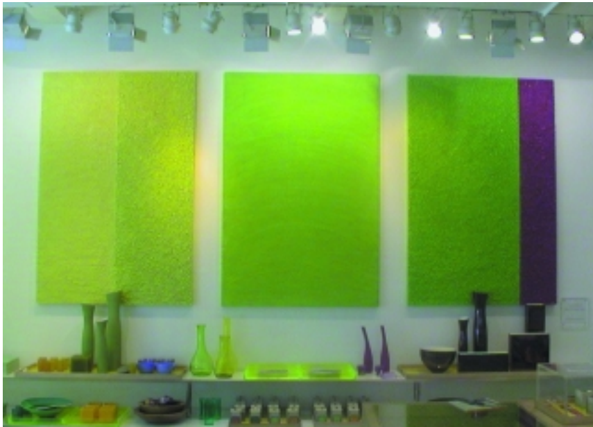
Salt Of The Earth, 2000 Art & Fashion Together on Madison Avenue, New York 2000 DKNY